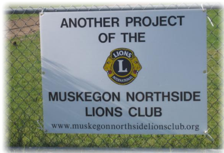
You may think we are bragging, but really, we are demonstrating our love for the community.