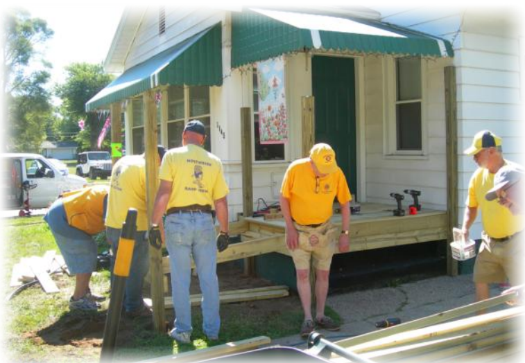
The Ramp Crew has completed another Ramp Project. Great job Lions!