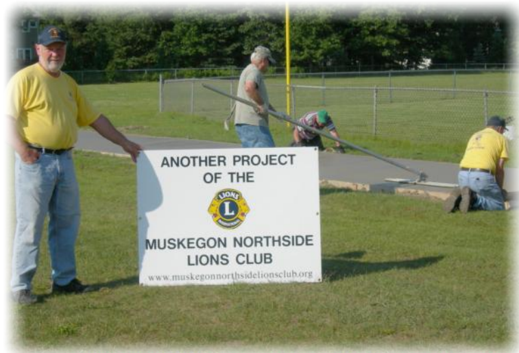
Muskegon Northside Lions working together with the community.