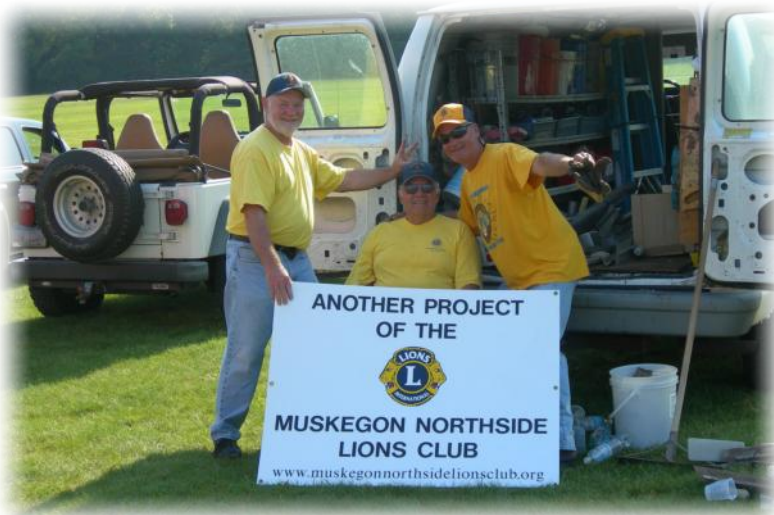
Muskegon Northside Lions, doing projects for the community.