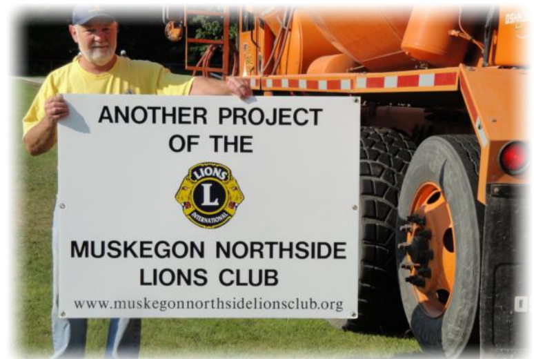
Muskegon Northside Lions, we have talent and we put it to work!